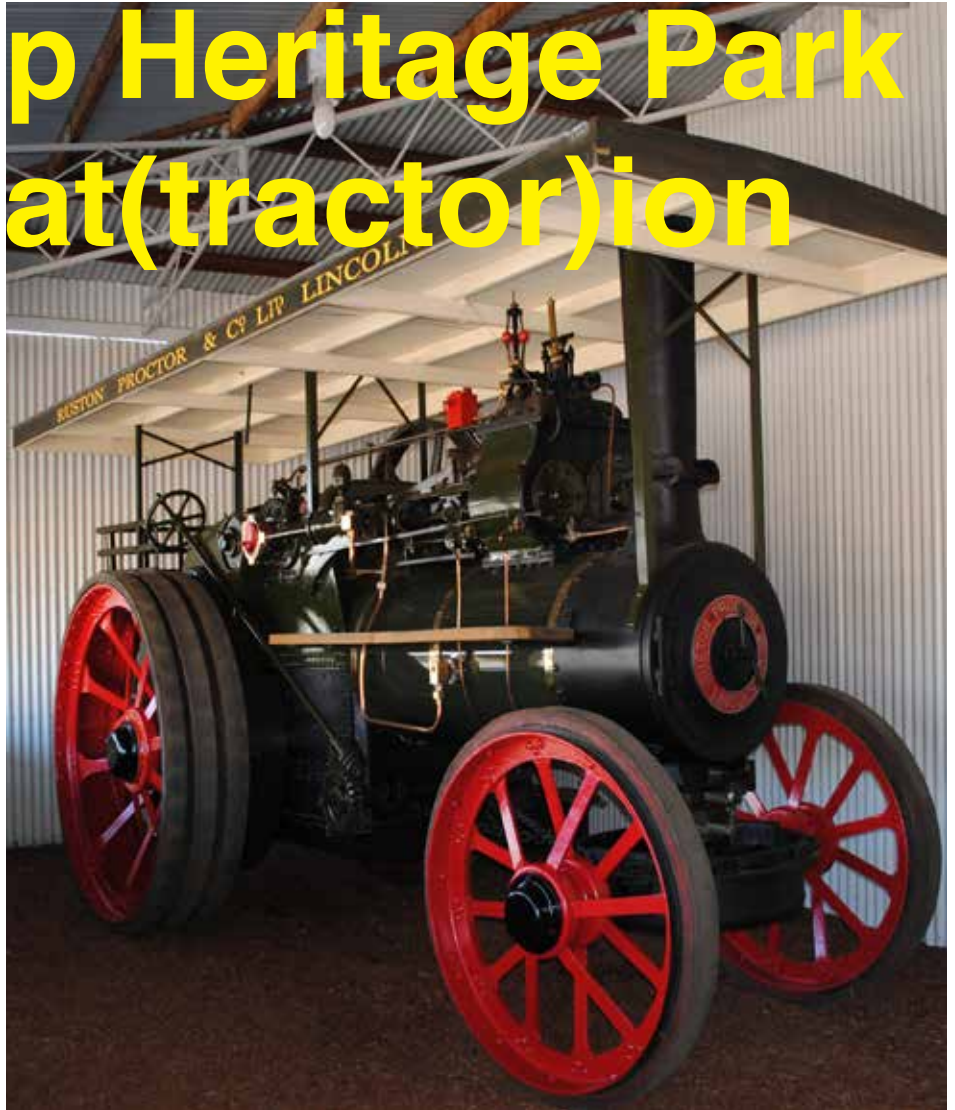
A fully restored 1911 Ruston Proctor Traction Engine.

There is also plenty for the ladies with rooms stashed full of house-